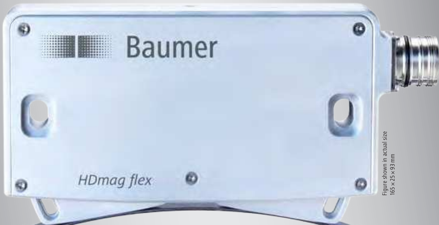
Figure shown in actual size 165 x 25 x 93 mm

The magnetic belt encoder provides all output signals regardless of the shaft diameter. After all, this is how current encoder technology should work: You are provided with exactly the resolution you need for any large shaft diameter.